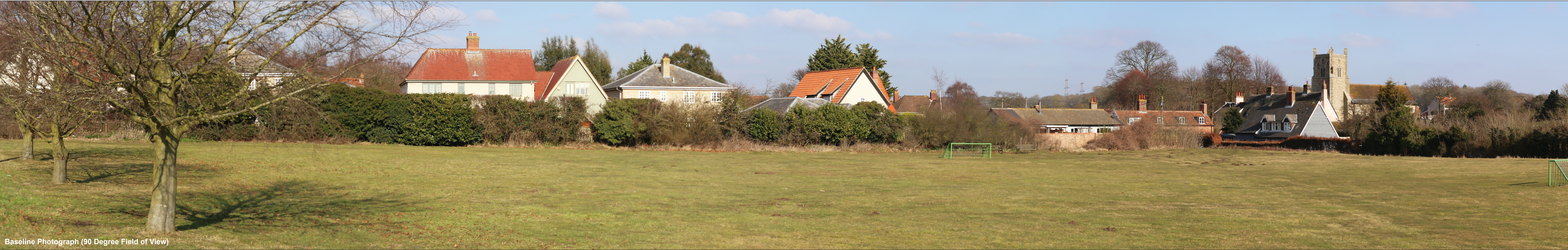
Baseline Photograph (90 Degree Field of View)