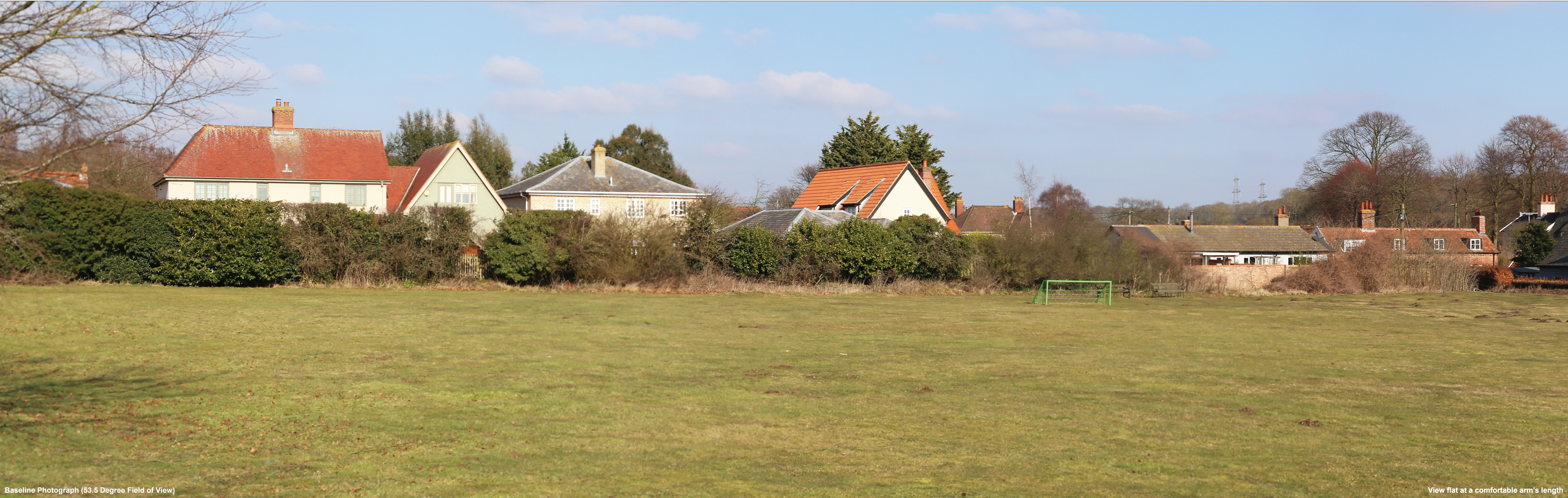
Baseline Photograph (53.5 Degree Field of View)