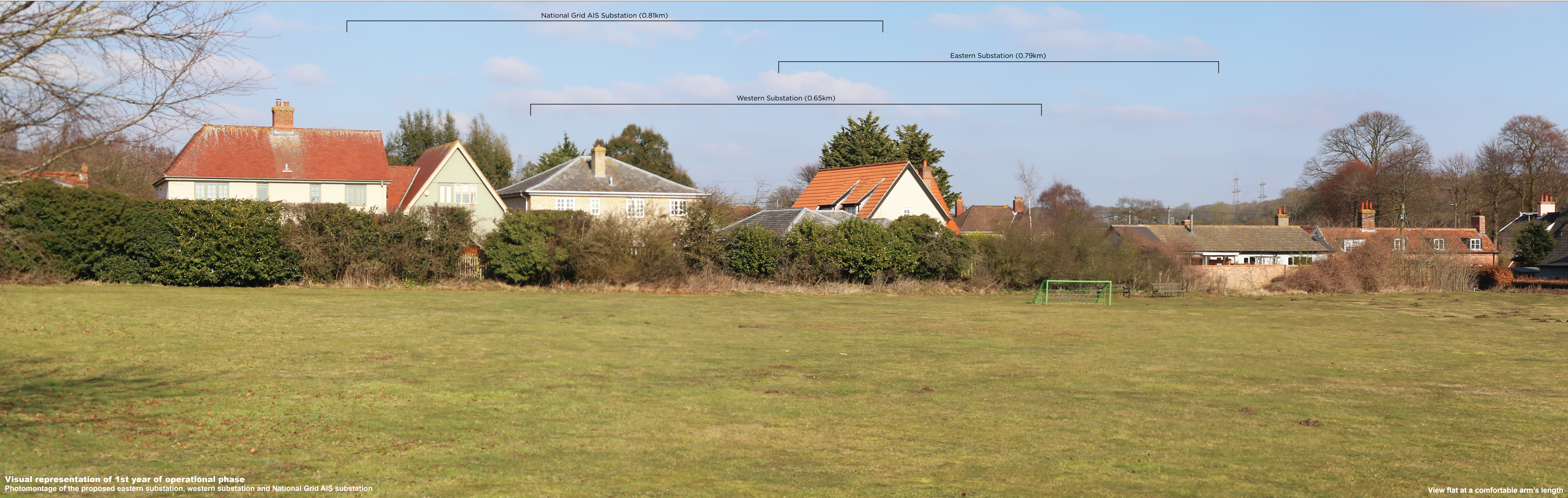
Visual representation of 1st year of operational phase Photomontage of the proposed eastern substation, western substation and National Grid AIS substation