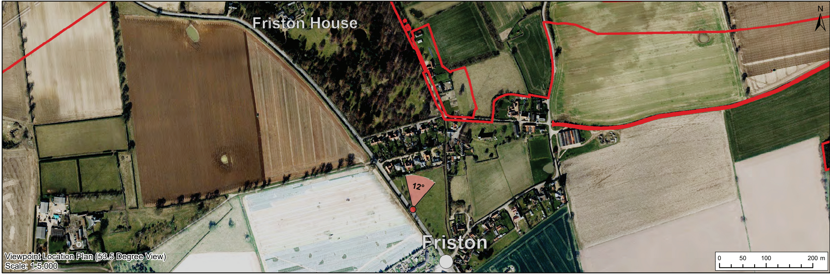
Viewpoint Location Plan (53.5 Degree View) Scale: 1:5,000