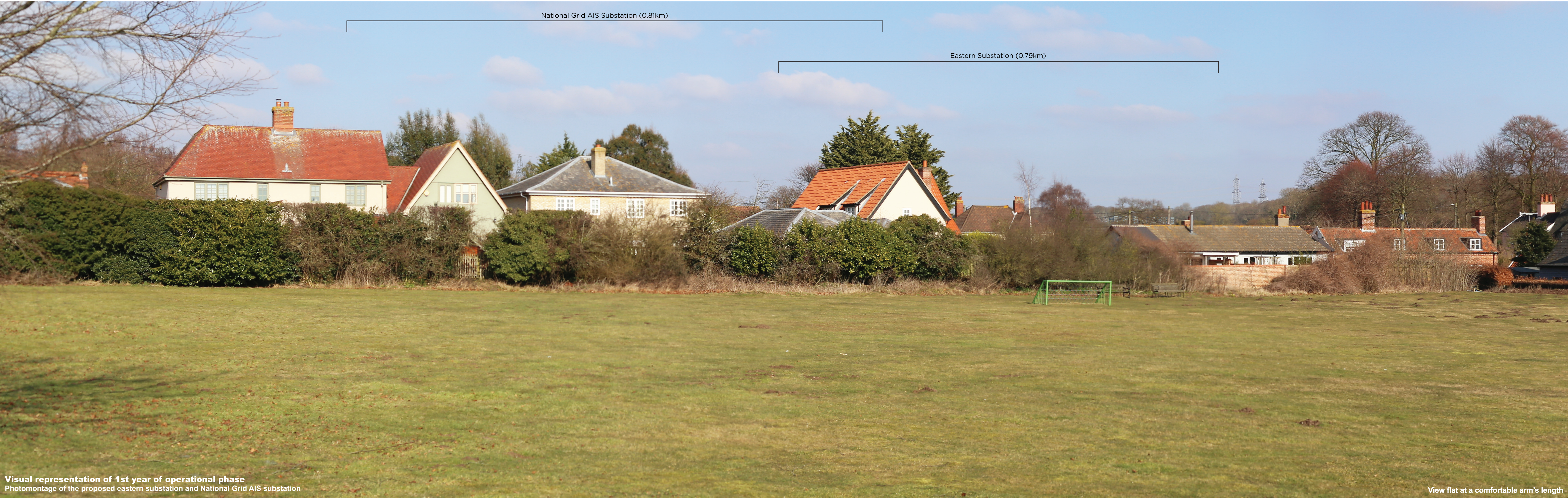
Visual representation of 1st year of operational phase Photomontage of the proposed eastern substation and National Grid AIS substation